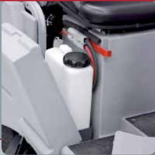
Ecoflex chemical kit (optional): easy accessible detergent cartridges