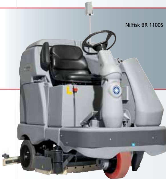
Nilfisk BR 1100S

BR 1100S/1300S is the most productive unit in its class. With more scrub path options, disc or cylindrical interchangeable scrub decks, a drive wheel torque regulator for better control and enhanced traction, as well as better suction efficiency, this unit simply outperforms other similarly sized scrubber/dryers. Furthermore all the machines are now equipped with the new Ecoflex system, which keeps the consumption control, but it also guarantees the possibility to boost temporarily water, detergent and brush pressure for all the more aggressive cleaning tasks.