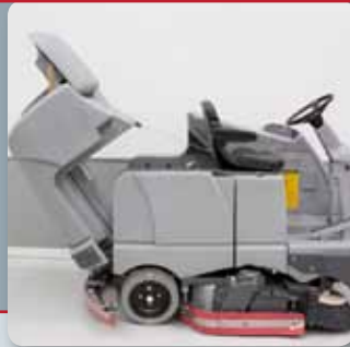
Tilt steering wheel for easy boarding, plus ergonomically designed operator compartment for safety and comfort