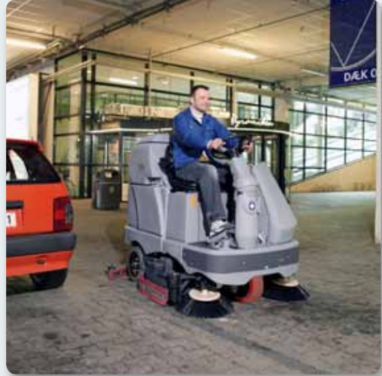
Nilfisk BR 1300S