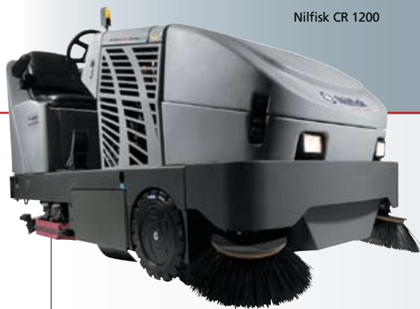
Nilfisk CR 1200

Nothing is left to chance. All models are available as diesel, petrol or LPG with the CR 1100 and CR 1200 also having battery variants to meet the specific cleaning applications. The tank capacity is larger than any other comparable machine, providing longer running time, higher productivity and lower cleaning costs. Operator comfort is at an all-time high, thereby reducing fatigue and increasing safety and performance. Maintenance has never been easier thanks to the 'no tools' service access points.